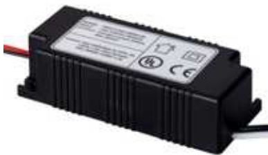
External Power Supply (Driver)