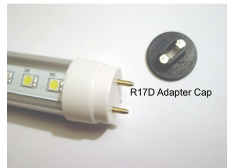
R17D Adapter Cap